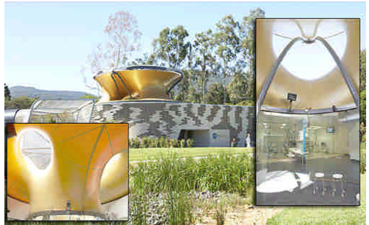
The Australian Wildlife Centre with views of interior